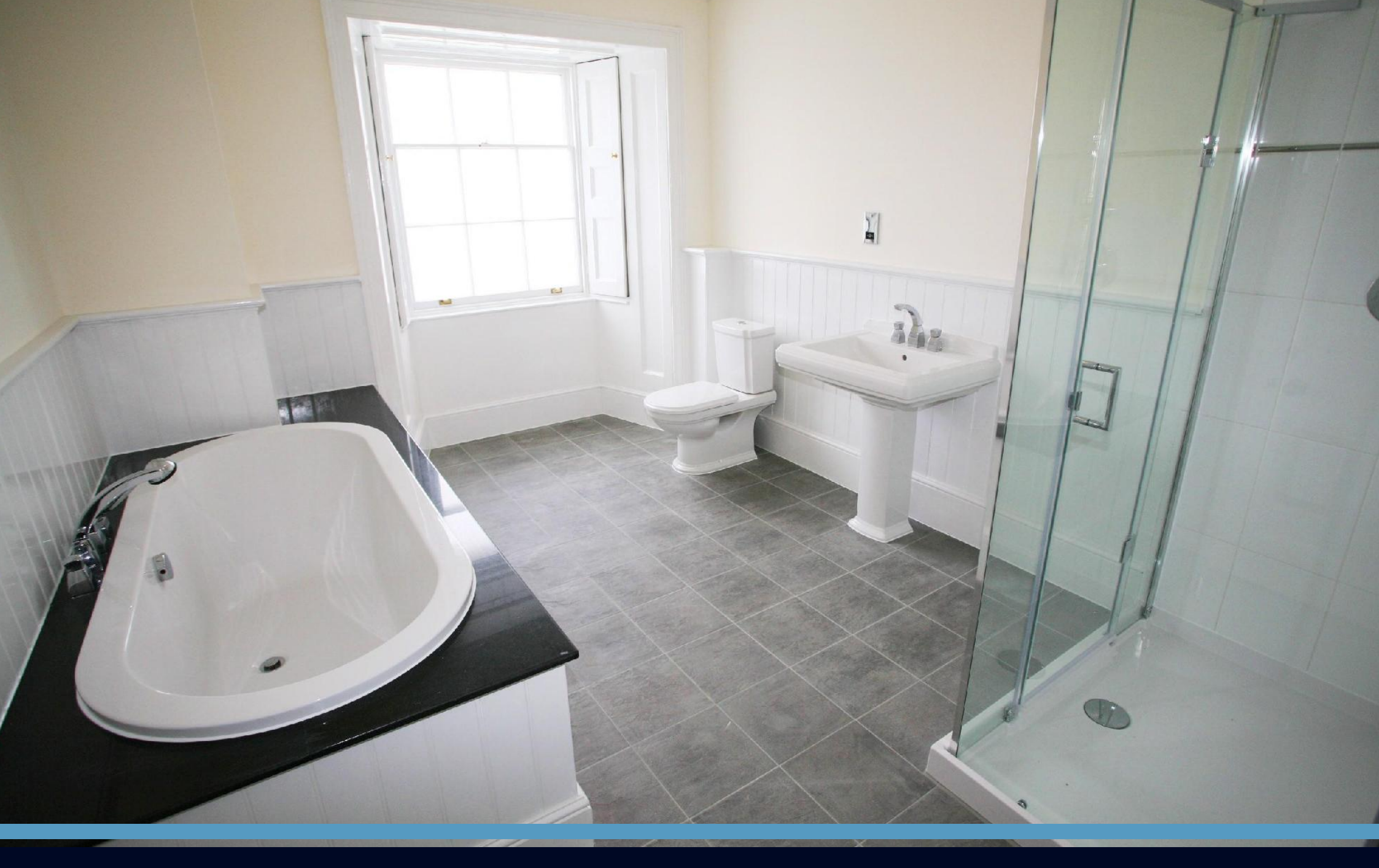
Typical Bathroom Finish