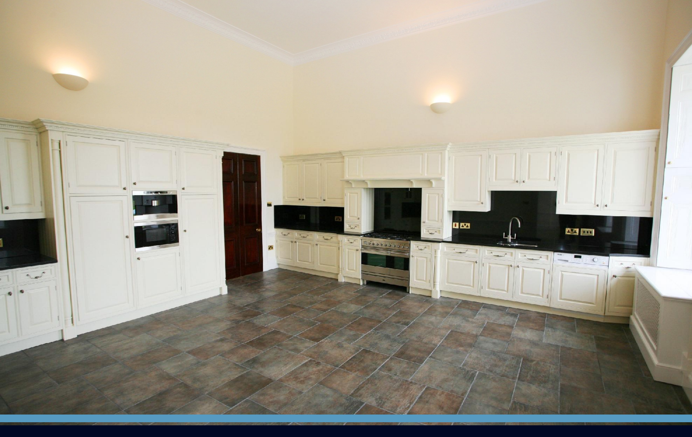
Typical Kitchen Finish