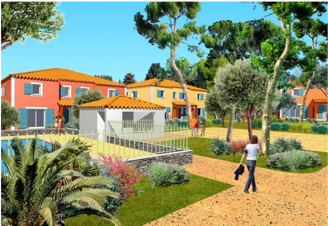
Artists impression of the development.

A investment development of 1 and 2 bedroom semi-detached houses with up to 9 month annual owners occupancy in an exceptional location close to both Mediterranean seaside resorts and vibrant historic cities.