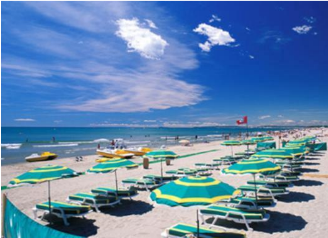
The beach at La Grande Motte

Le Mas des Cigales is the perfect residence for people who would like to discover the French Mediterranean coast, its amazing landscapes and its culture, as it is at the crossroads of vibrant southern cities, famous seaside resorts and amazing natural reserves.