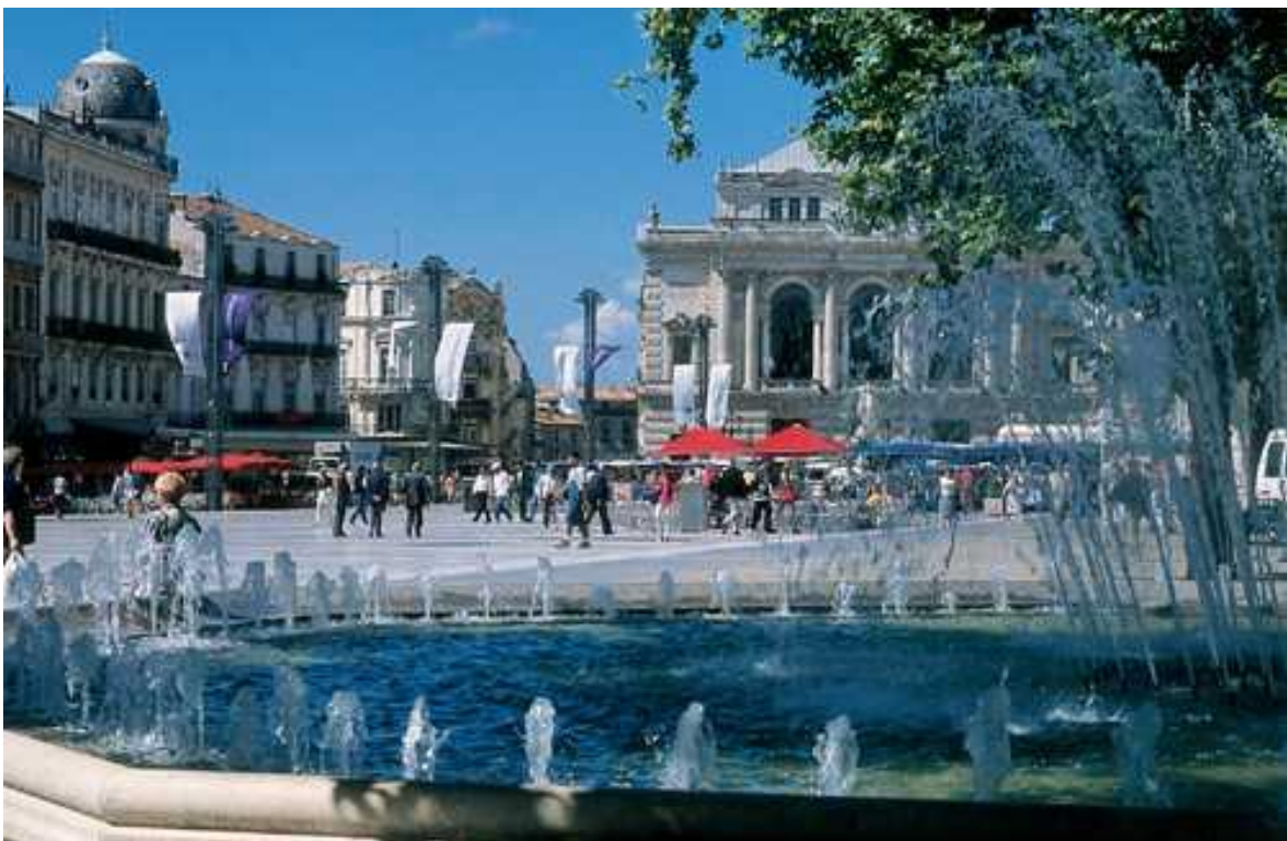
The centre of Montpellier

With option 2 those looking for a holiday home can enjoy personal use for most of the year, receive a guaranteed rental income and potential for additional rent and have the security of knowing that their property will be fully managed for the next 10 years.